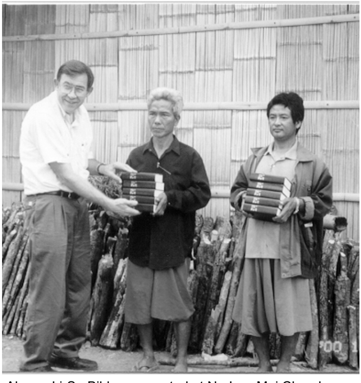
Above: Li-Su Bibles presented at Na-Loa-Mai Church. Below: Pang-Krang church meets in home of member.

Periodical Postage Paid Memphis, TN 38101